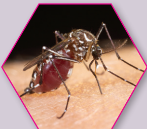
Female Aedes aegypti mosquito feeding

Pirbright carries out research to understand how genetically modified mosquitoes can be used for the control of mosquito populations to prevent diseases of both livestock and people.